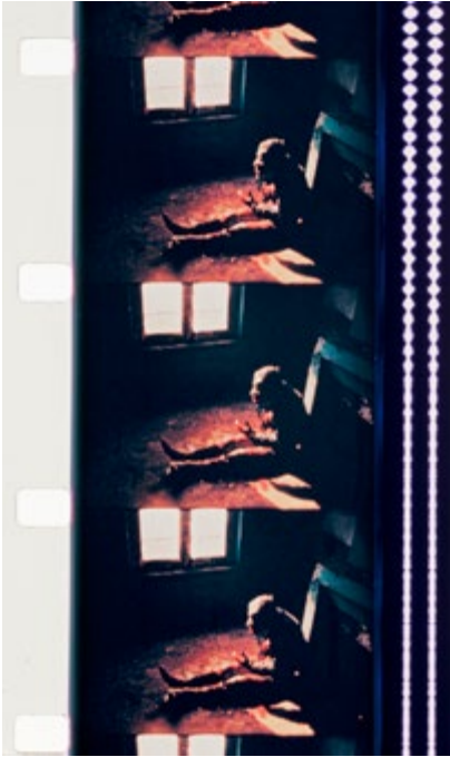
L'Homme qui tousse [The Coughing Man], 1969

Digitised 16 mm films, black and white and colour, sound Purchases, 1975