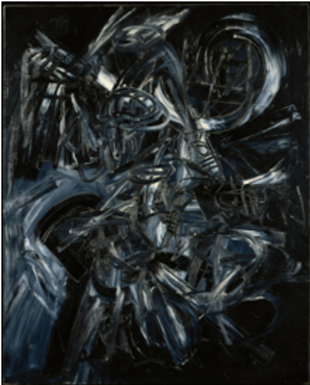
Antonio Saura, Inès , 1957. Oil on canvas, 162 x 130 cm

Named after the title of an exhibition at Galerie Maeght in 1946, this section features abstract artists that turned to the restraint and solemnity of black. In the aftermath of war, Pierre Soulages became known for thick calligraphic symbols painted in walnut stain, the first pieces in a body of work dedicated almost exclusively to the colour black. Like André Marfaing , Soulages explored the full visual and expressive potential of strong contrasts with white. This chromatic minimalism makes the artist's vocabulary of gestures even more visible, along with the more or less ductile qualities of the materials. While Gérard Schneider drew inspiration from music, opting for vigorous brushstrokes, Hans Hartung enlarged his ink on paper across the canvas. The opposition between black and white can also instil a feeling of gravity, or even tragedy, as in the work of Antonio Saura , which draws on the great tradition of baroque Spanish painting.