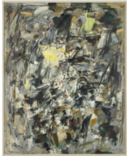
Joan Mitchell, Sans titre [Untitled], 1954. Oil on canvas, 254 x 203,7 cm

“On the floor, I am more at ease. I feel nearer, more a part of the painting, since this way I can walk around it, work from the four sides and literally be in the painting.”