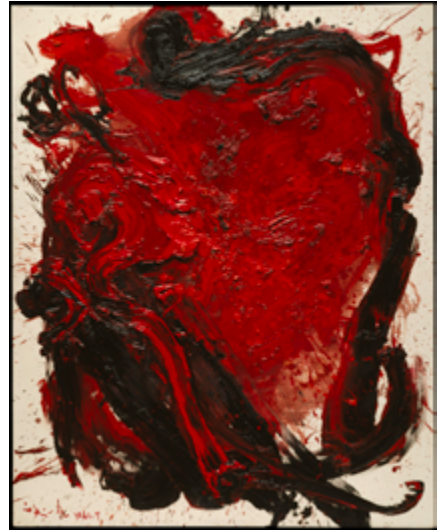
Kazuo Shiraga, Chizensei Konseimao (Nature Planet) , July 1960. Oil on canvas, 161,5 x 130 cm

"My painting becomes unreadable. Still lifes and flowers no longer exist. I tend towards an imaginary, indecipherable form of writing."